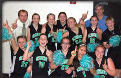
MCYO 2011 Girls Basketball Champions

Kindergarten and 8th Grade Buddies-Building Friendships to Last a Lifetime